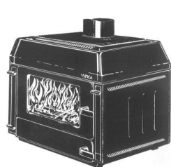
NEW MODEL MULTI