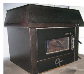
OLD MODEL MULTI