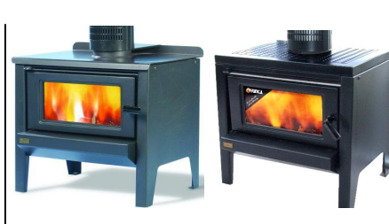
HOBSON & FITZROY